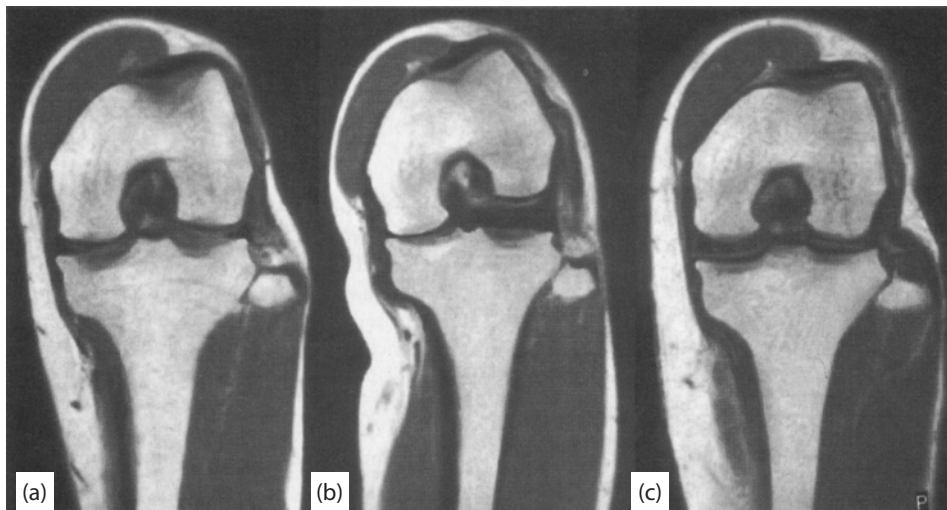
Figure 6.1 Representative MR scans of the left knee in (a) a neutral position, (b) under passive varus stress, and (c) under passive valgus stress.

Since the LCL and the posterior capsule are demonstrably slack in the flexed knee, the constant width of the medial gap at all angles of flexion (except full extension) implies that the MCL and the cruciates exert a net isometric effect on that compartment throughout that range of movement. After medial unicompartmental replacement, both the stability of the knee and the entrapment of the free bearing depend upon reproducing this isometric mechanism. (The difference between the compliance of the two compartments in flexion explains why bearing dislocation is a problem laterally.)